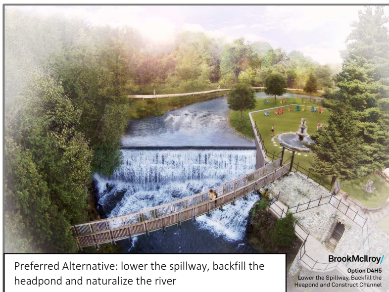
Preferred Alternative: lower the spillway, backfill the headpond and naturalize the river

The Preferred Alternative was determined based on comments and input from the public, our Stakeholder Advisory Committee and our agency partners. It was identified as the alternative which best met CVC's objectives for the site.