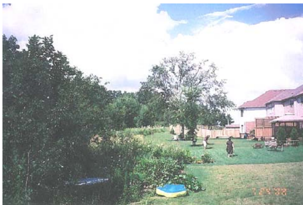
Example of homeowner encroachment upon greenway

Several instances of encroachment upon the greenway space have been observed following construction. For instance, in the image below, of the greenway is used for storage. Other incidences reported include the placement of sod on the greenway adjacent to private property, establishment of vegetable gardens and dumping of yard wastes.