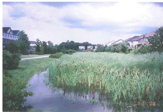
Portion of greenway affected by high groundwater table

Surface water and groundwater monitoring also revealed the impact of the groundwater table on the performance of the infiltration practices. The large majority of the greenway system has had no issues with slow infiltration rates or ponding. However, one section of the greenway did experience ponding due to the presence of an elevated groundwater table in the area.