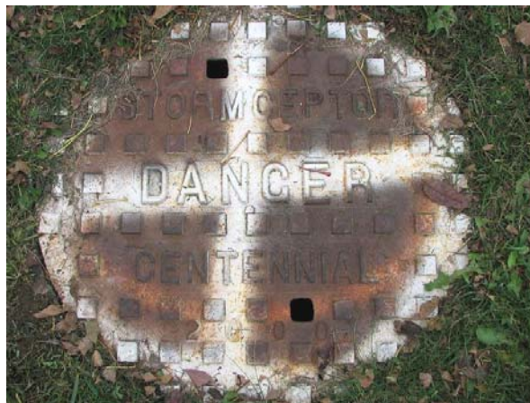
Manhole cover on Stormceptor oil & grit separator

For larger catchments, forebays were installed at the storm sewer outfalls to trap additional sediment.