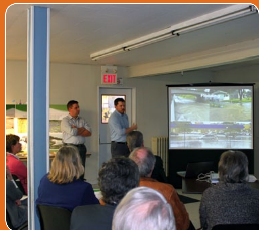
CVC staff presenting to members of the Lorne Park Estates community.

On Wednesday March 21, 2012 CVC held a community session to discuss LOISS with members of the Lorne Park Estates community. Presentations were delivered by representatives from CVC, the City of Mississauga and the Region of Peel. This was followed by an in-depth discussion of the environmental concerns specific to the Lorne Park Estates community.