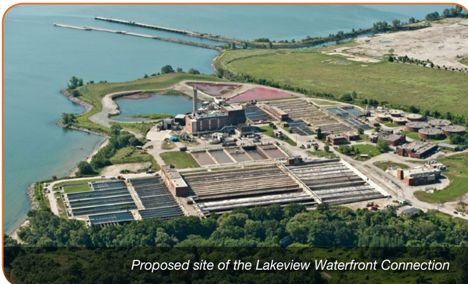
Proposed site of the Lakeview Waterfront Connection

The first phase in this multi-year project is an environmental assessment led by CVC. The public is encouraged to provide feedback on the project. Please visit www.creditvalleyca.ca/lwc for more information and to find out how you can get involved.