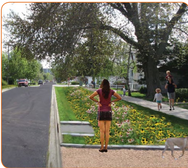
Conceptual drawing of the LID retrofit at Lakeview.

The project is currently under construction. Residents gathered together on April 15, 2012 to launch the project. Construction is anticipated to be completed by fall of 2012.