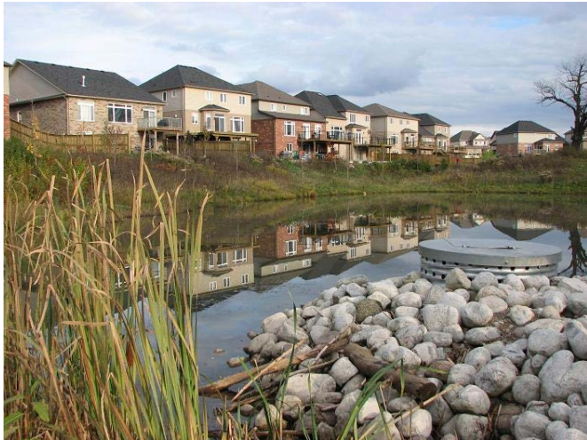
Picture of stormwater management pond used to pre-treat stormwater prior to infiltration via kettle depressions

Westminster Woods East utilizes a more conventional approach to stormwater management, although stormwater is still infiltrated on site. Stormwater is conveyed to a traditional stormwater management pond where suspended solids can settle. Treated stormwater is drained via a perforated riser pipe with an orifice plate.