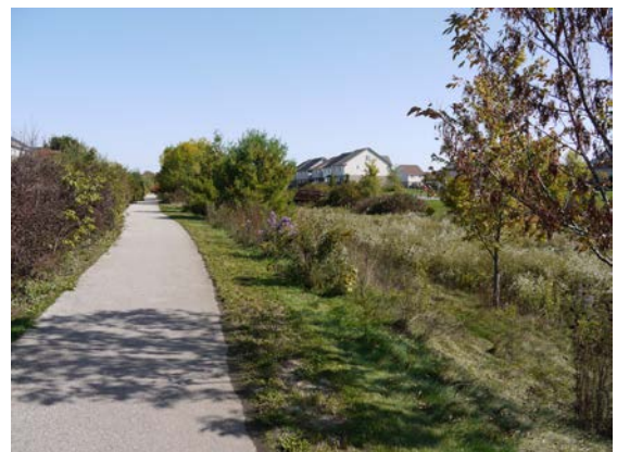
Picture of the greenway network in Westminster Woods, showing the walking trail (left) and the greenway (right)

One of the premier design features of the greenway system is its integration with passive recreation features within the community. A walking trail runs parallel to the network of greenways throughout Westminster Woods West, providing opportunities for residents to walk along the heavily vegetated corridors. Other amenities, like playgrounds are placed near the greenways, but are at a higher elevation for safety purposes. Houses also back onto the greenways, providing the developer the opportunity to sell premium lots.