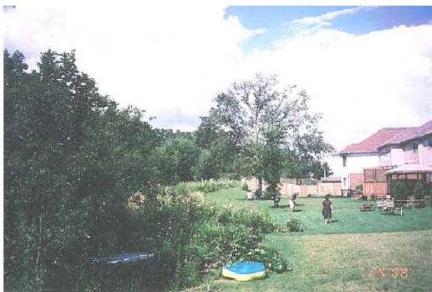
Example of homeowner encroachment upon greenway

Several instances of encroachment upon the greenway space have been observed following construction. For instance, in the image below, of the greenway is used for storage. Other incidences reported include the placement of sod on the greenway adjacent to private property, establishment of vegetable gardens and dumping of yard wastes.