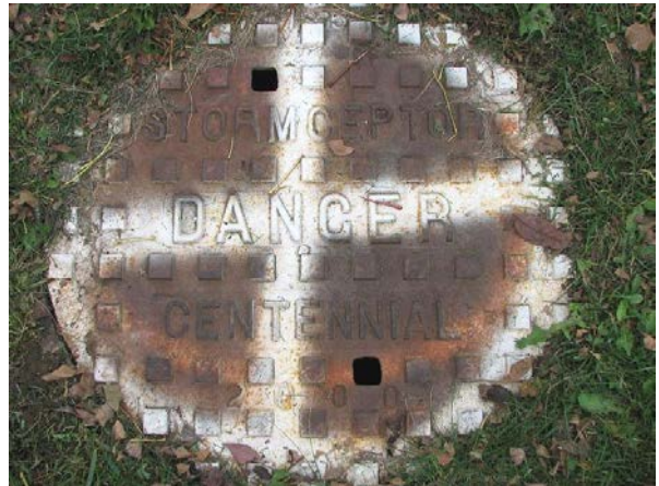
Manhole cover on Stormceptor oil & grit separator

For larger catchments, forebays were installed at the storm sewer outfalls to trap additional sediment.