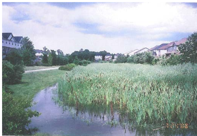
Portion of greenway affected by high groundwater table

Surface water and groundwater monitoring also revealed the impact of the groundwater table on the performance of the infiltration practices. The large majority of the greenway system has had no issues with slow infiltration rates or ponding. However, one section of the greenway did experience ponding due to the presence of an elevated groundwater table in the area.